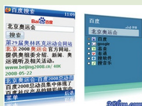
UCWeb PPC | V7.1